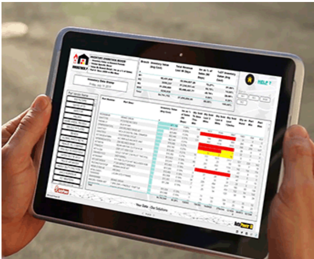
Quickly Displays Dead Stock AutoPowerBI

If you're looking to create a more data-informed organization — and who isn't today? AutoPowerBI Inventory Analysis solutions are exclusively designed for our industry and to help you track inventory and better manage what is probably your largest asset.