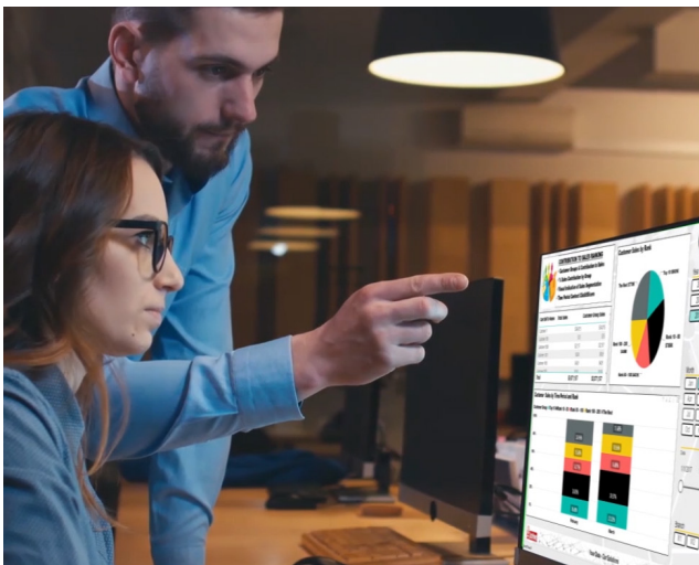
Enables Quick Decisions AutoPowerBI

One of our most popular inventory reports attacks dead stock by making it extremely visible.